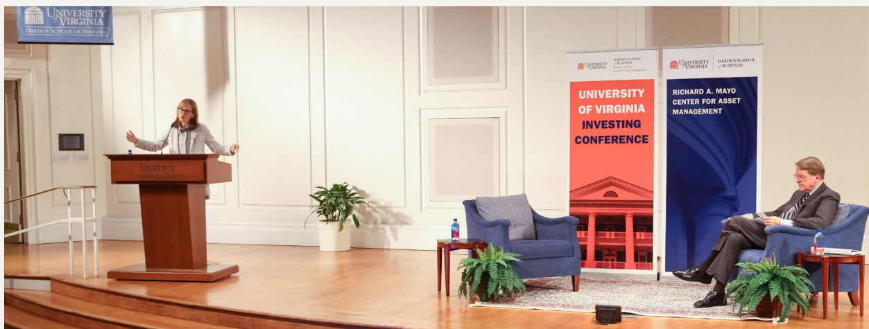
University of Virginia Investing Conference

The annual DPEC is organized by the student-run Darden Private Equity Club, with support from Darden's Mayo Center for Asset Management. Attendees included students, alumni and private equity practitioners who gathered at Darden to discuss industry hot topics, including impact investing; environmental, social, and governance (ESG) investing; the state of the private equity industry; and founding and building private equity firms. The April 2022 conference featured a keynote talk by David M. Rubenstein, co-founder and co-chairman of The Carlyle Group, a global investment firm with $301 billion of assets under management. www.darden.virginia.edu/mayo-center/events/private-equity-conference